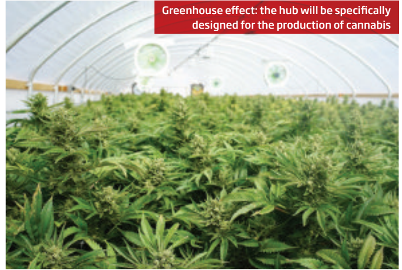
Greenhouse effect: the hub will be specifically designed for the production of cannabis

Cripes, now that's what Metropolis would call a business-oriented approach to living the high life.